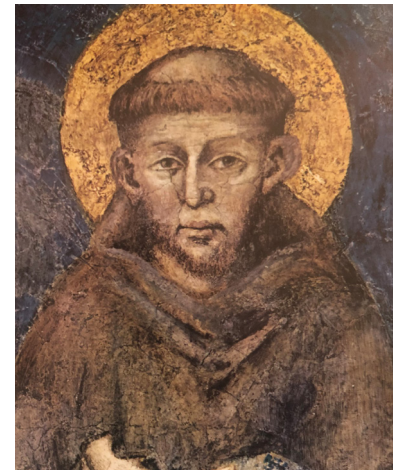
Encounter God & the Saints