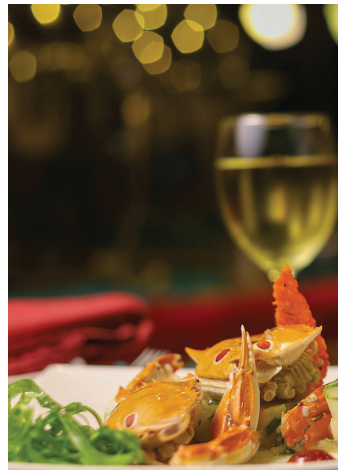
Taste Italian Cuisine