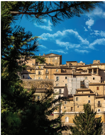
Walk through History

Over 25 Years' Experience - Answering Christ's Call - Coordinating & Leading Pilgrimages