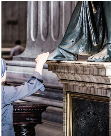
Touch Sacred Places