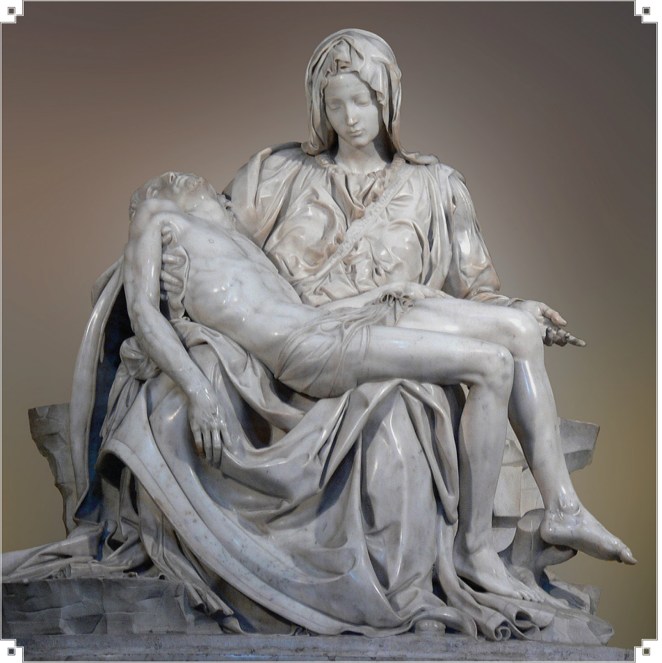
Michaelangelo's Pietà , St. Peter's Basilica, Rome