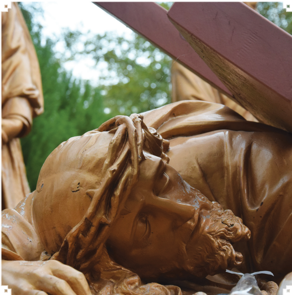
The Ninth Station of the High Stations in Lourdes, France