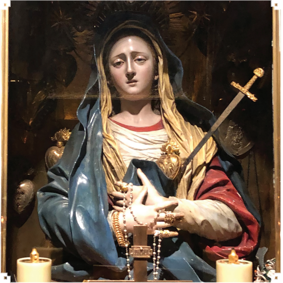
Our Lady of Sorrows on Mount Calvary Church of the Holy Sepulchre, Jerusalem