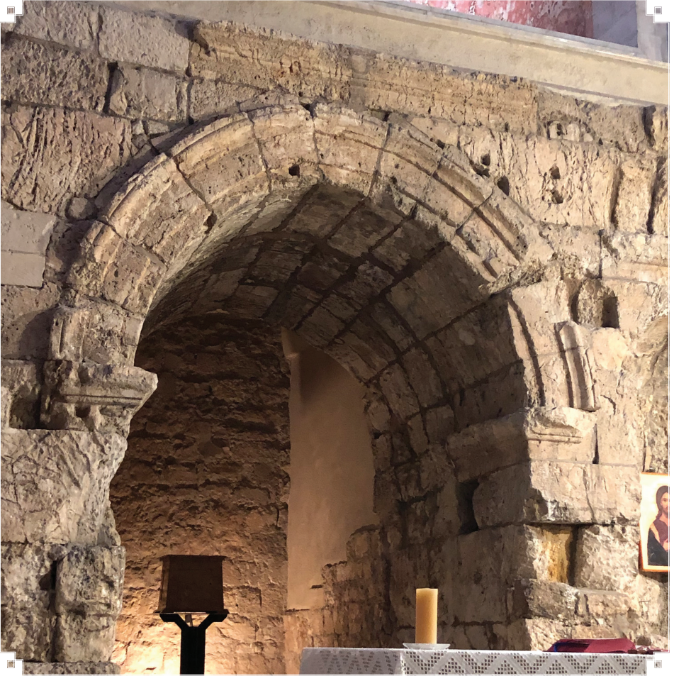
Photo of Ecce Homo in Jerusalem's Old City, where tradition holds that Jesus was condemned. Ecce Homo in Latin means Behold the man .