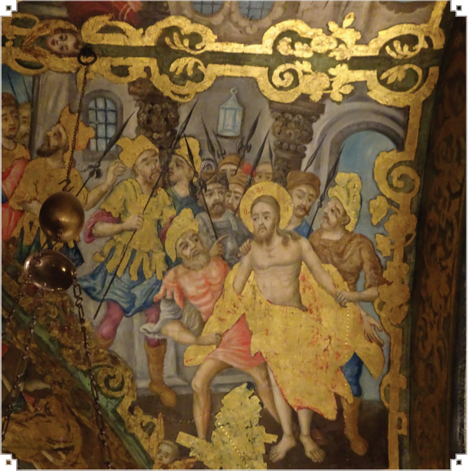
The Tenth Station in the Church of the Holy Sepulchre, Jerusalem