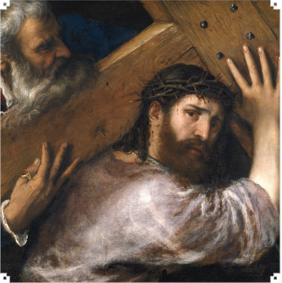
Titian's Christ Carrying the Cross

SIMON OF CYRENE HELPS JESUS CARRY HIS CROSS