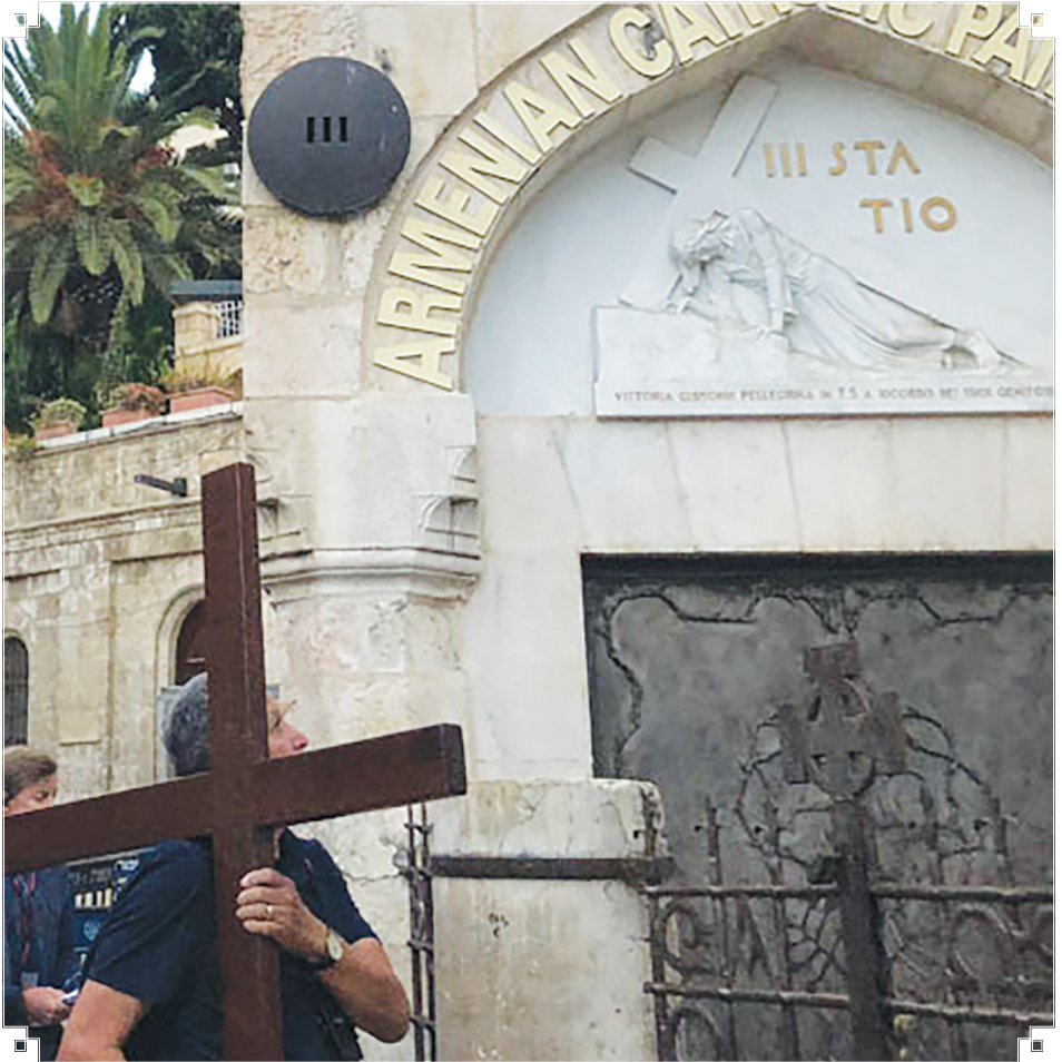
The Third Station on the Via Dolorosa in Jerusalem