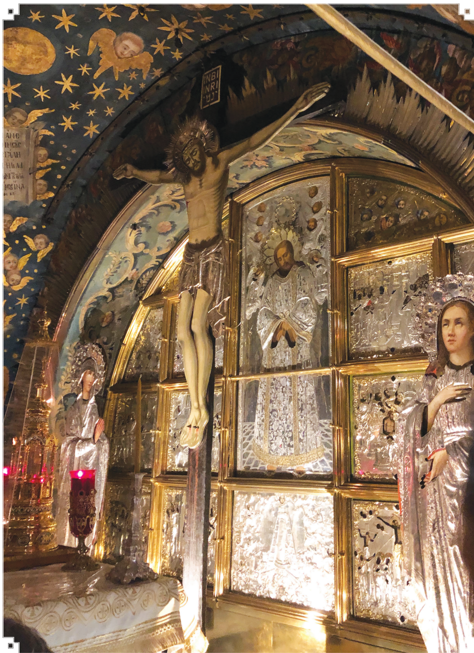
Site of the Crucifixion on Mount Calvary Church of the Holy Sepulchre, Jerusalem