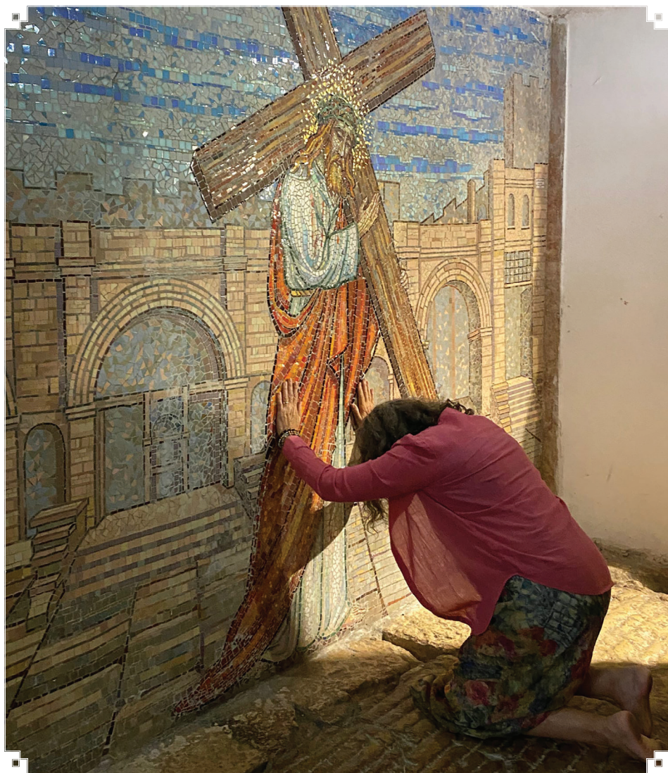
This image reminds us of Jesus' consoling words to the women Stone Pavement underneath the Via Dolorosa in Jerusalem (Traditional site of Jesus' flagellation)