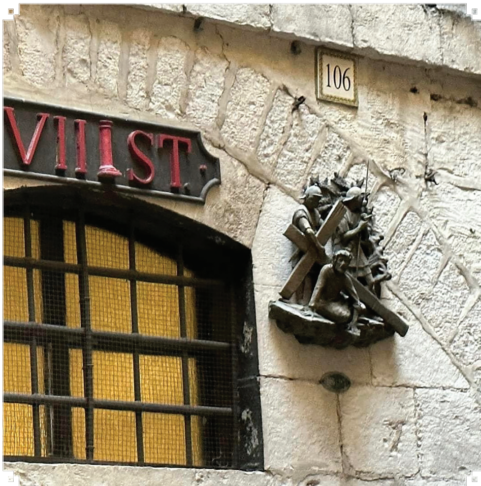
The Seventh Station on the Via Dolorosa in Jerusalem