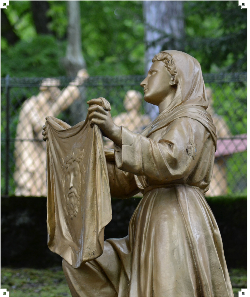
The Sixth Station of the High Stations in Lourdes, France