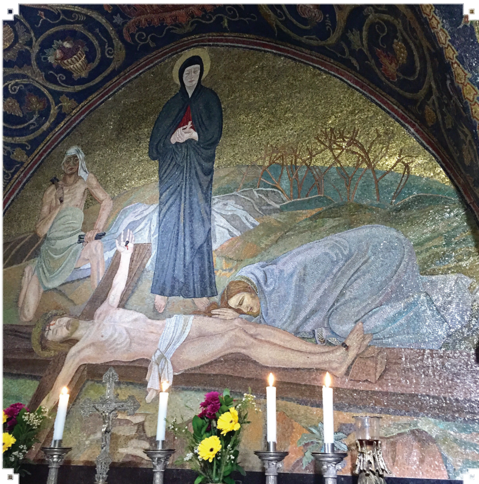
The Eleventh Station in the Church of the Holy Sepulchre, Jerusalem