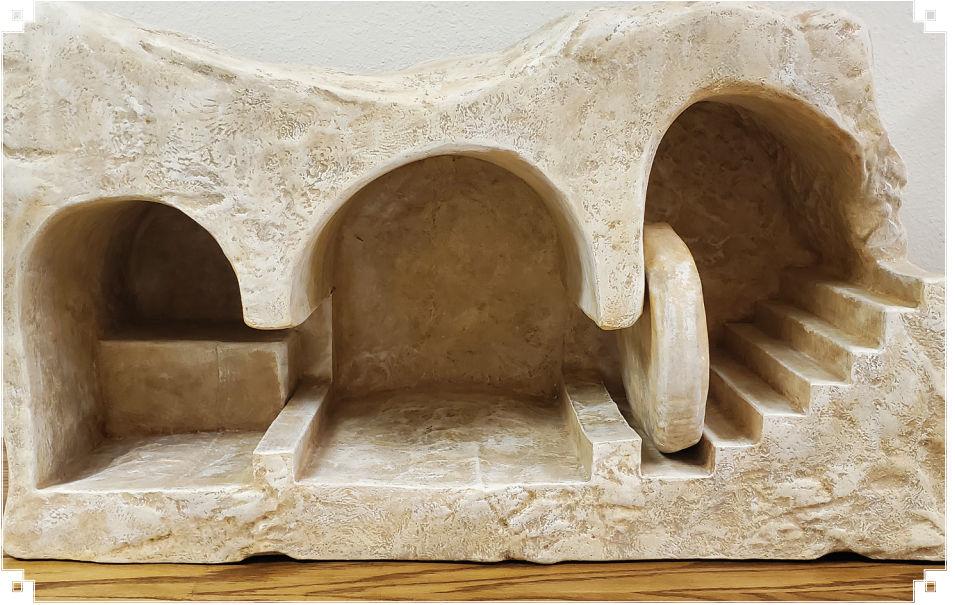
Replica of Christ's Tomb, Pilgrim Center of Hope, San Antonio, Texas